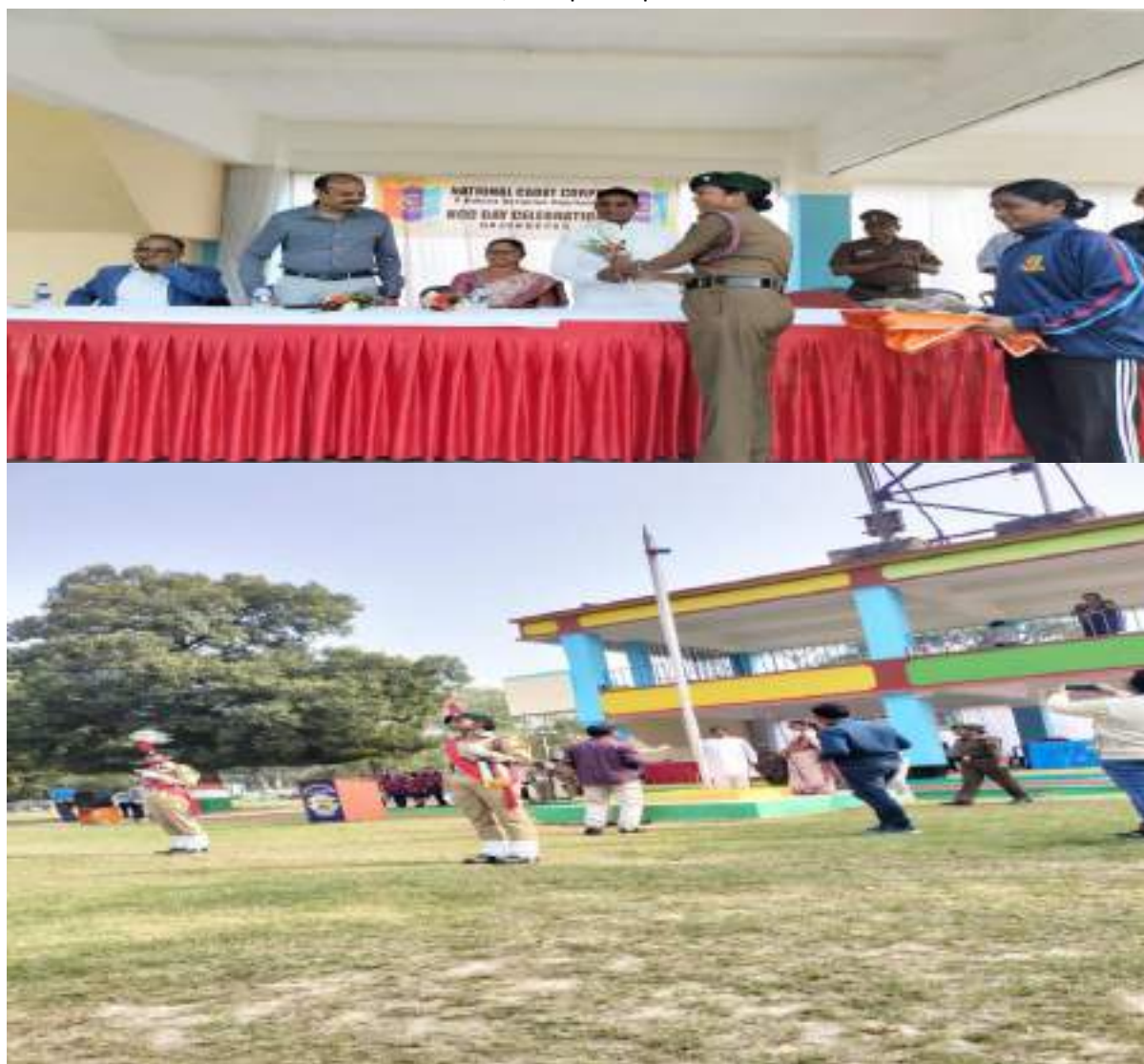
NCC day celebration

National Cadet Corps Day serves as a tribute to the cadets and officers involved in the program and their commitment to nation-building. It highlights the NCC's role in promoting discipline, leadership, and a spirit of service among the youth, preparing them to contribute positively to society. NCC Cadets of SARBATI DEVI WOMENS COLLEGE, RGP participated to this events.