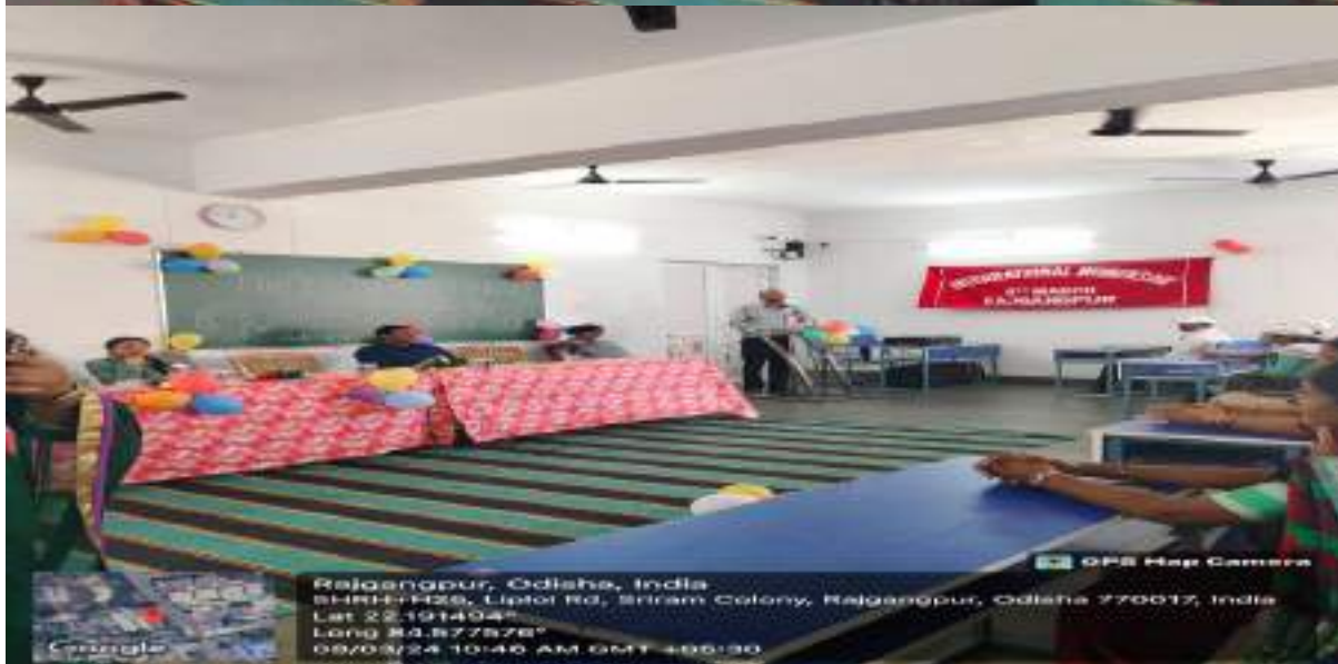
International women's day celebration on 08.03.2024