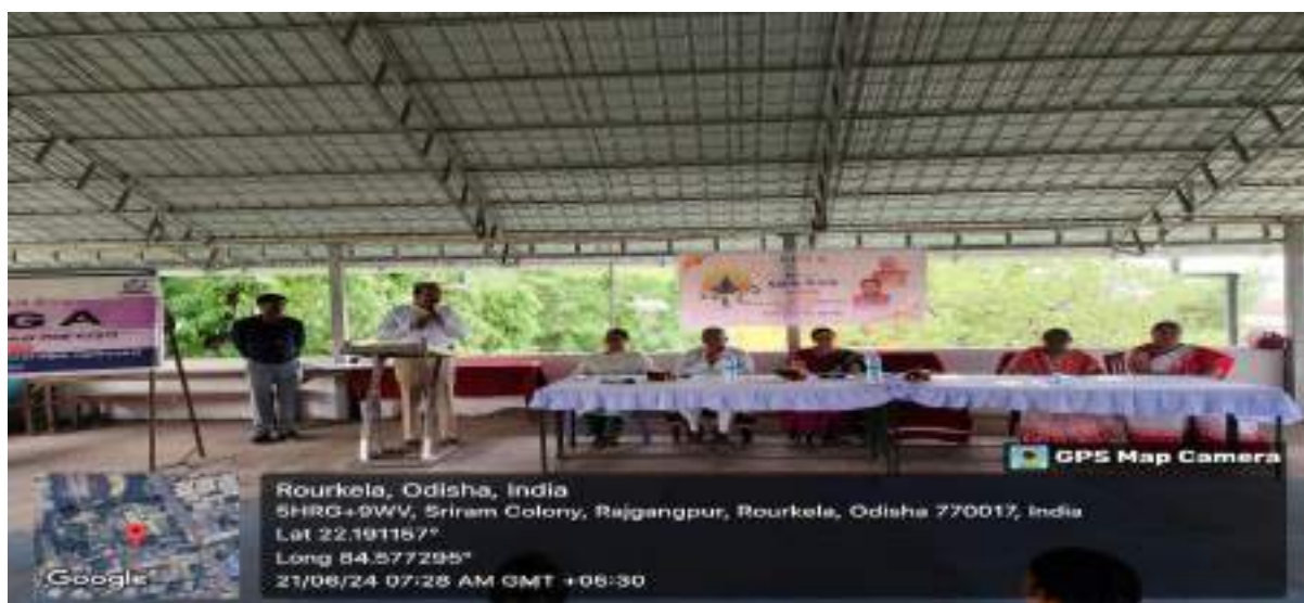
International yoga day celebration