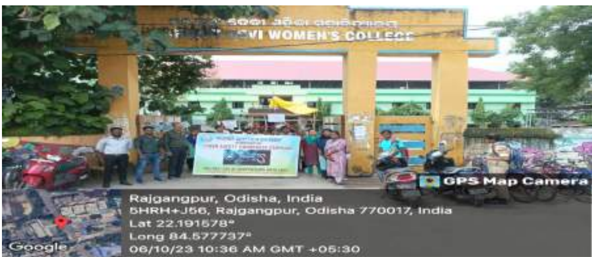
CYBER SECURITY AWARENESS RALLY