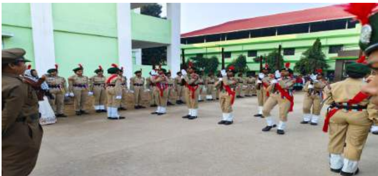
CELEBRATED 75TH REPUBLIC DAY