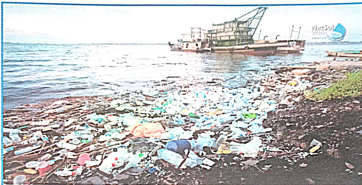
Marine Pollution, Introduction and Types

THE IMPACT OF MARINE POLLUTION IN A SPECIFIC AREA