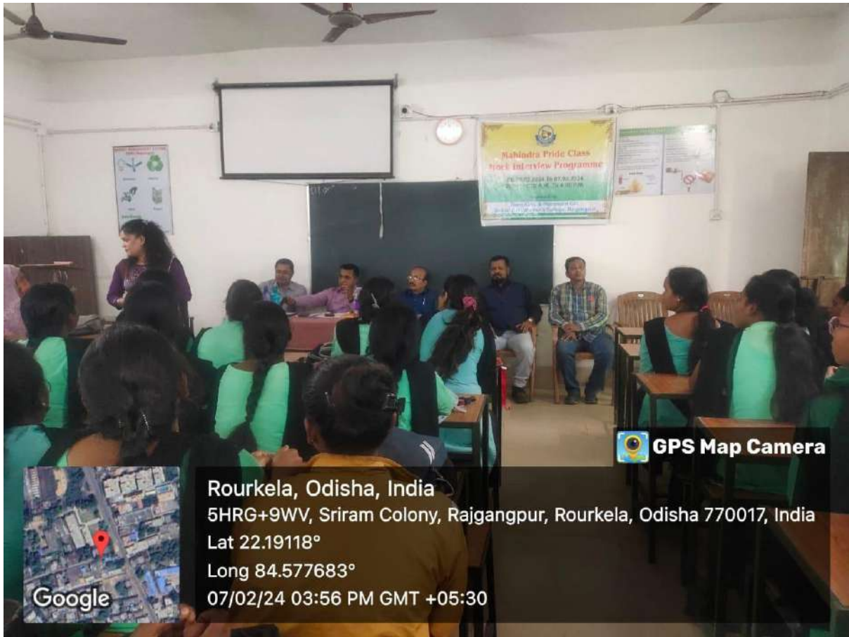
(Master trainer interacting with the students)