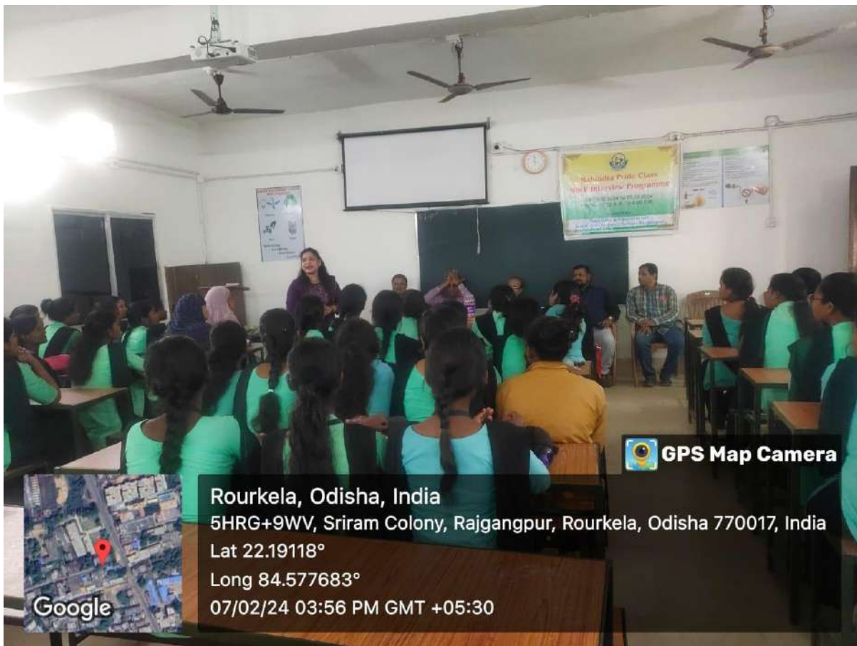
(Master trainer interacting with the students)