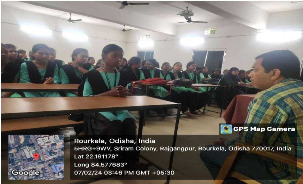
(Sapan sir interviewing the students)