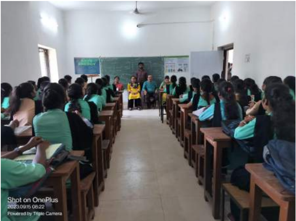
Shot on OnePlus 2023.09.15 08.22 Powered by Triple Camera