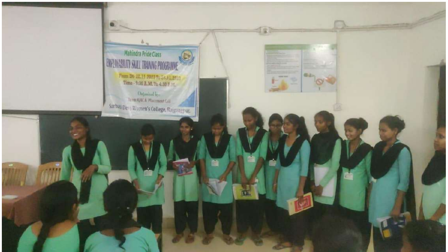
(Classroom activities for students)