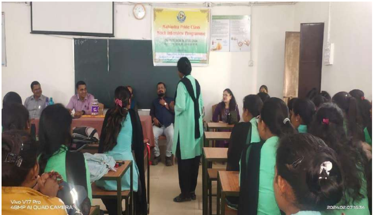
(Students sharing their experiences)