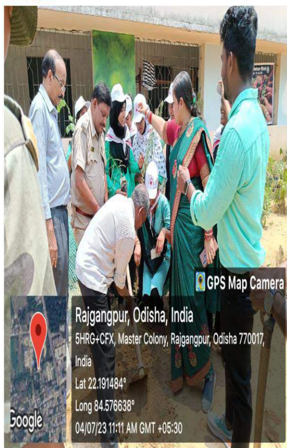
Van Mahotsav (4 th July 2023 )