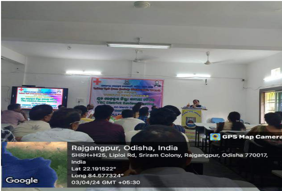
YRC District Review meeting: 04.03.2024