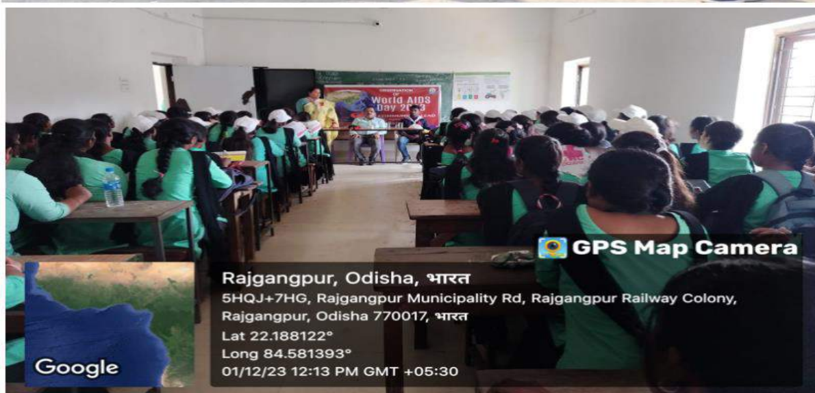
Worlds Aids Day: 01.12.2023