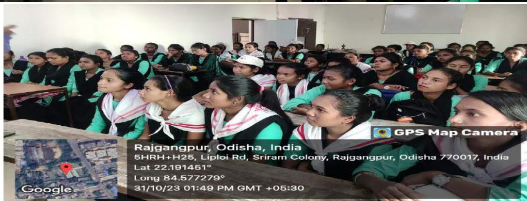
Induction programme 31.10.2023