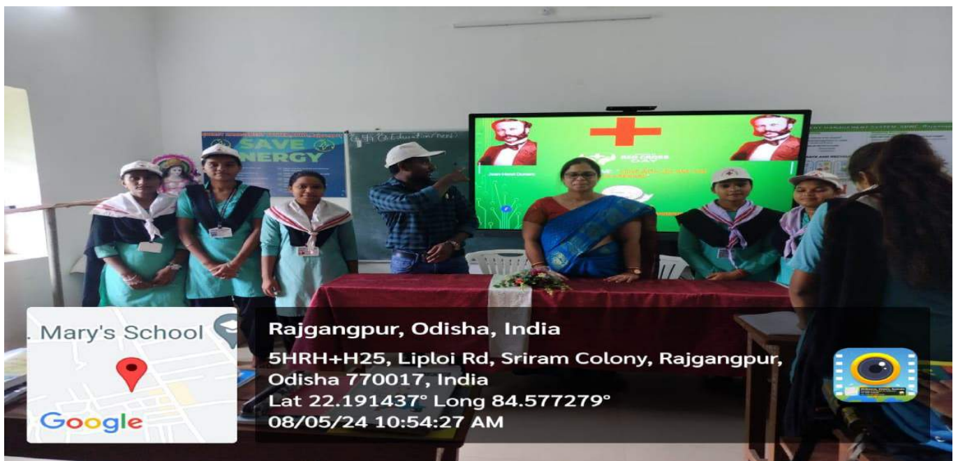
world Red cross day 08.05.2024