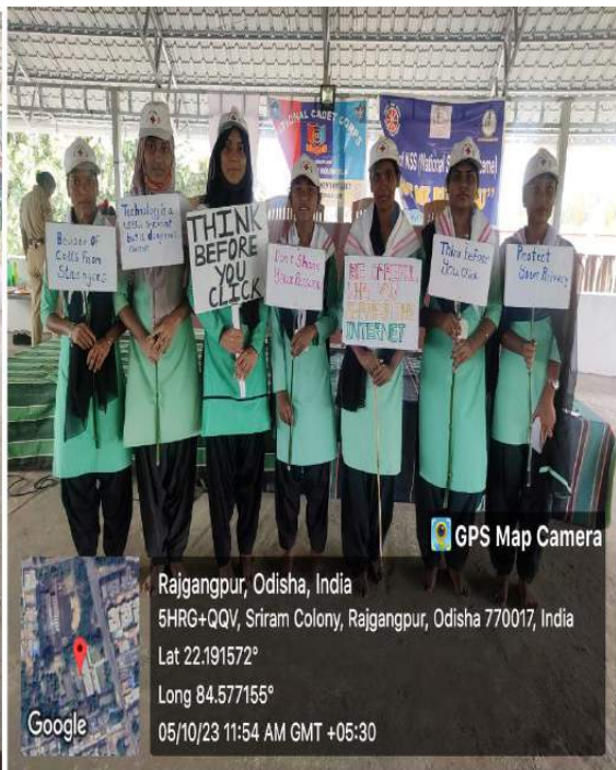
Cyber security campaign. 05.10.2023