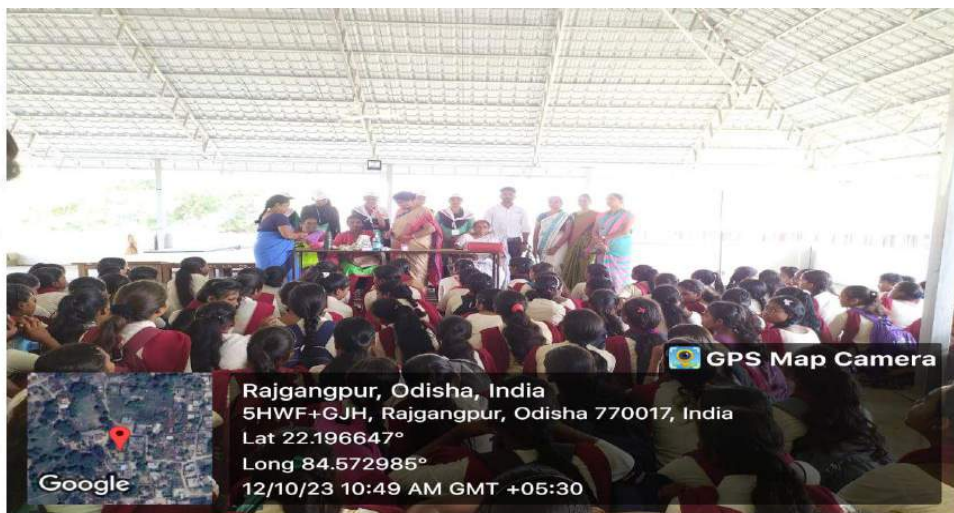
Amlan programme: 10.12.2023