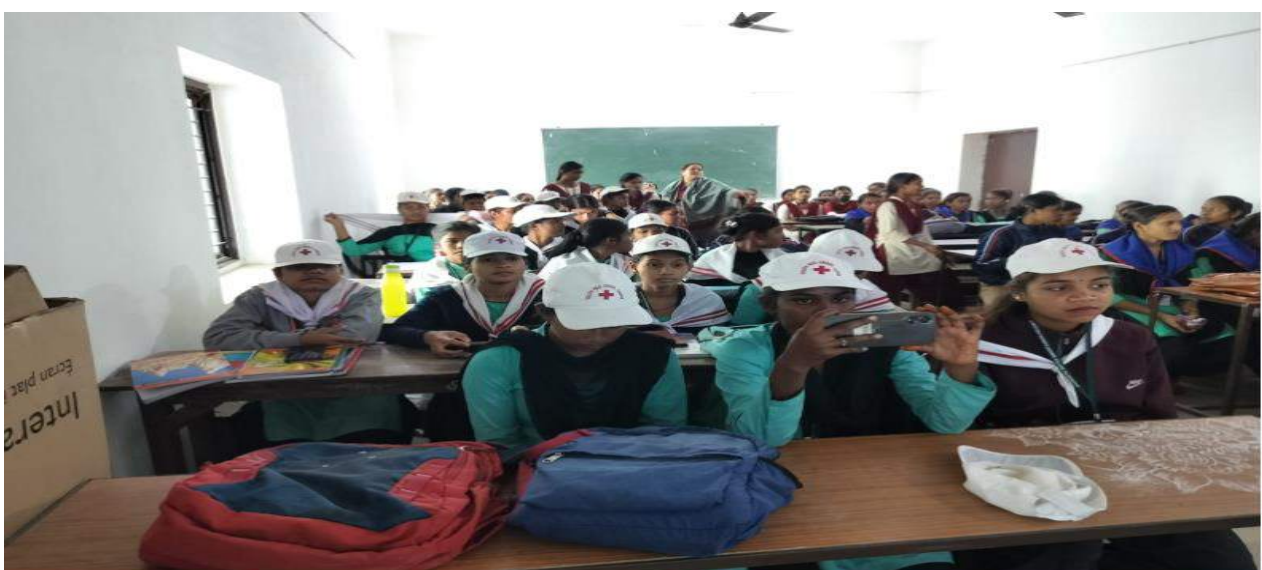
.National youth day 2024