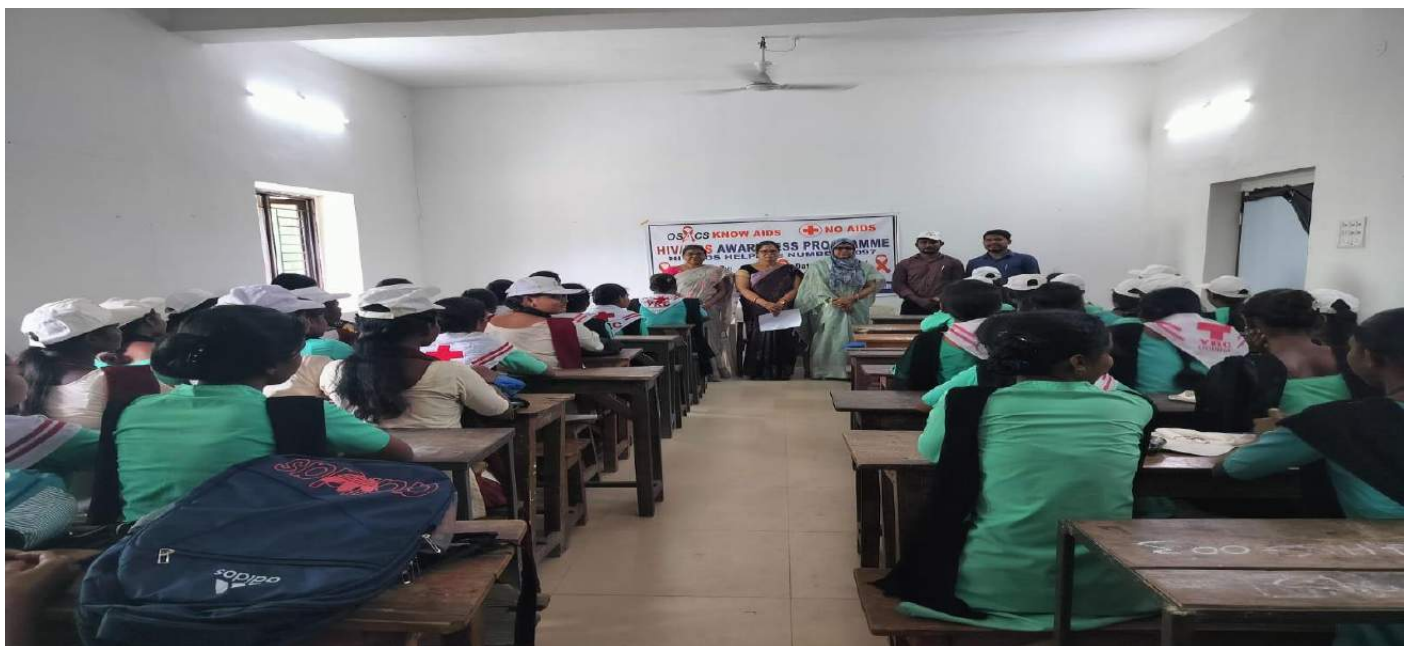
HIV/AIDS Awareness programme 03.04.2024