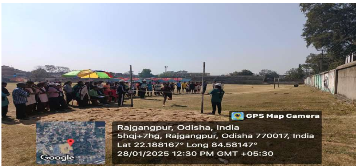
GLIMPSE OF HIGH JUMP