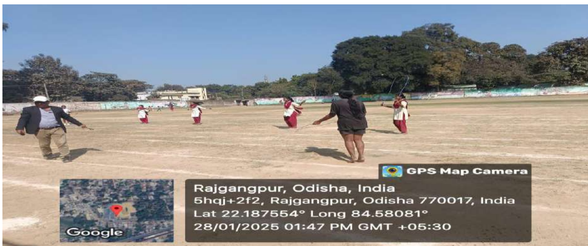
GLIMPSE OF SKIPPING