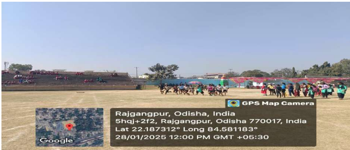
GLIMPSE OF 200 MTR RACE