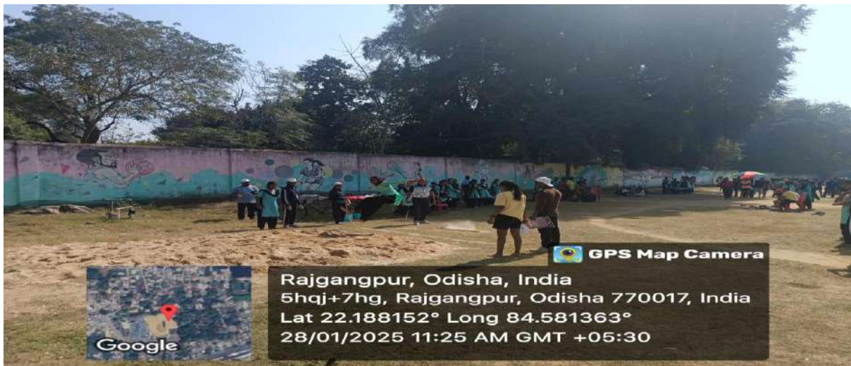
GLIMPSE OF LONG JUMP