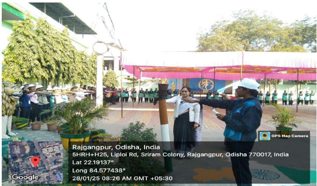
OATH TAKING BY THE PRINCIPAL AND ALL THE STUDENTS