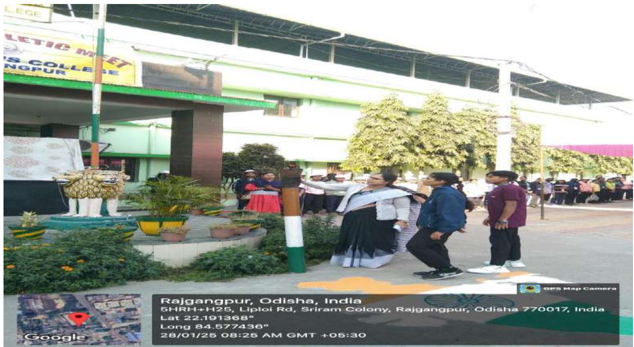
(LIGHTING THE TORCH BY THE PRINCIPAL)