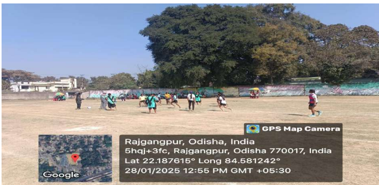
GLIMPSE OF RILEY RACE