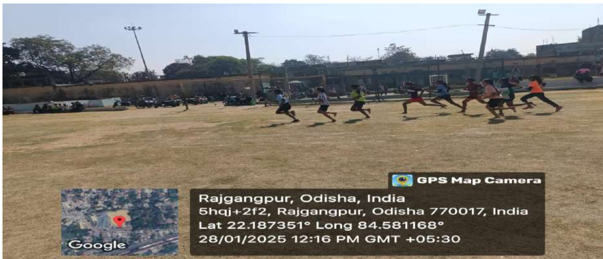
GLIMPSE OF 800 MTR RACE