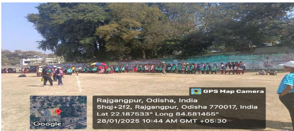
GLIMPSE OF SHOT PUT