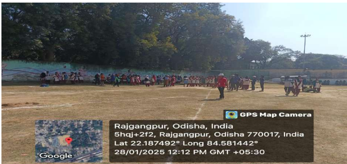
GLIMPSE OF DISCUSS THROW