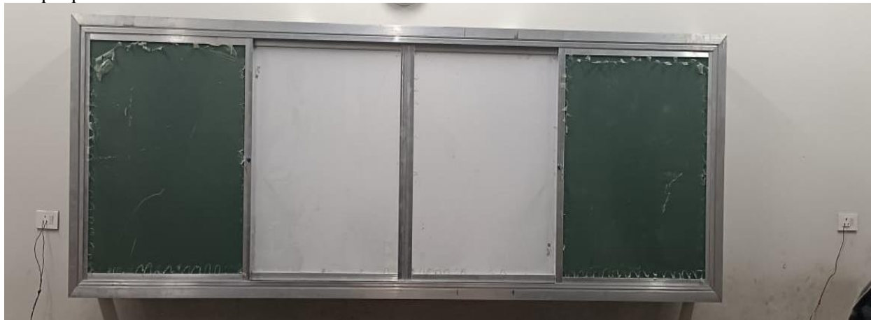
Sample pic of slider